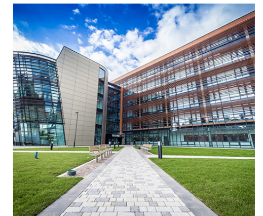
DE MONTFORT UNIVERSITY